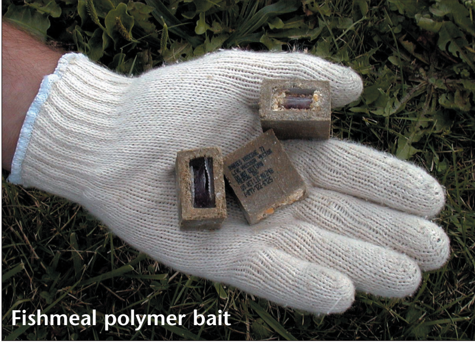
Fishmeal polymer bait