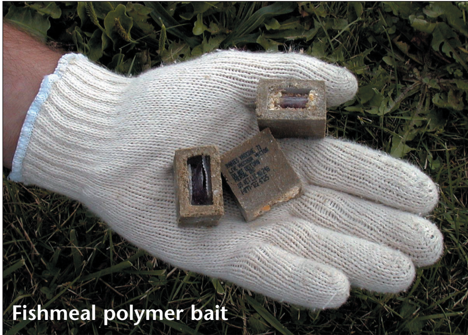
Fishmeal polymer bait