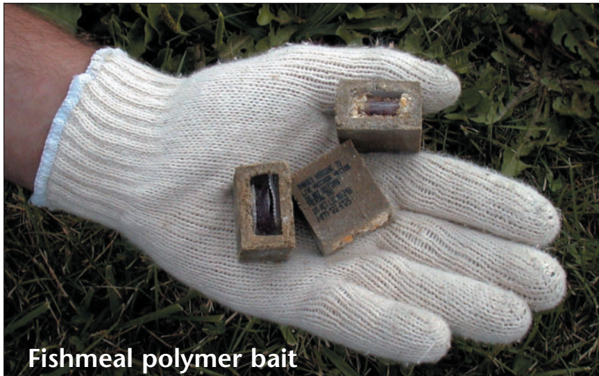
Fishmeal polymer bait