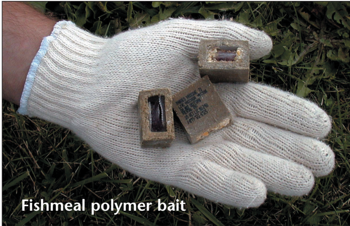
Fishmeal polymer bait